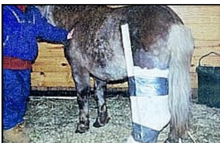
Pony with broken leg (illustration only)