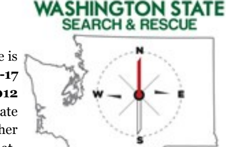
2012 CONFERENCE KLICKITAT COUNTY, WA

The next Washington State Search & Rescue Conference is scheduled to take placed in Goldendale, WA on May 14-17 2012 (pre-conference classes) and May 18-20, 2012 (conference classes). Members of the Washington State SAR community as well as SAR members from other states, Canada, Iceland, and other counties regularly attend this very informative training opportunity. Members of WASART's Technical Rescue Team will, for the second time, again do two presentations on rigging horses and