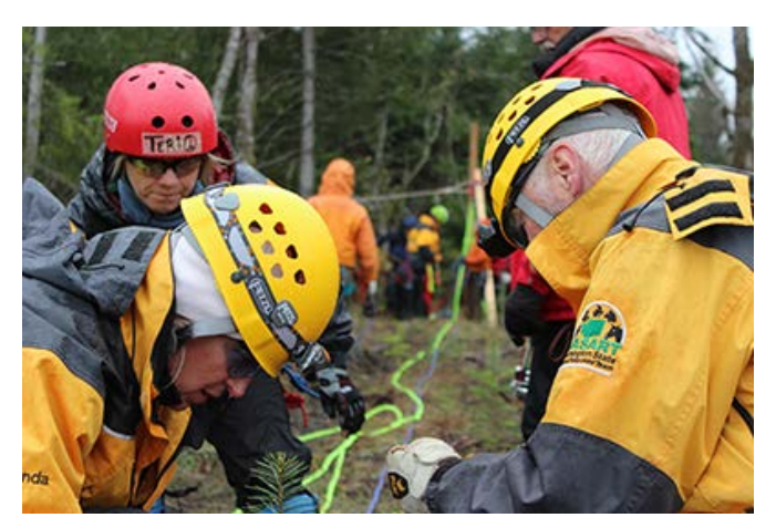
The Technical Rescue Team does more than learn skills when they train. As the team that deploys in situations such as a dog over a cliff, the team builds team spirit and strengthens trust during tough trainings such as Ropes 2.

Thirteen members of the WASART Technical Rescue Team (TRT)