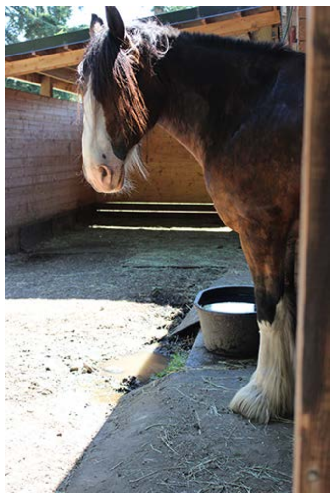
Rosie stands in her enclosure, patiently waiting for volunteers to practice horse handling skills on her. Rosie is one of the horses seized last year with nearly 40 other horses from a neglect case. She has been adopted by a WASART member.

WASART's Field Response qualified and Technical Rescue Team members train, train, train so that when the call for assistance is received, they're competent, confident, and ready to provide the skills needed to remove an animal from a life threatening situation. Some of that training involves learning how to rig a dog or a horse for rescue.