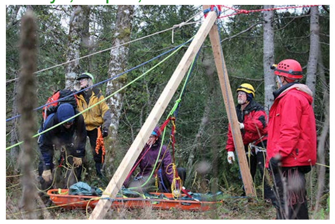
Volunteers practice pulling a litter and person up a hillside.

I'm very excited about the positive direction of our Technical Rescue Team. The TRT has a number of new members that are bringing lots of energy and resources to the team, along with impressive technical skills and desire to learn and improve. The team just completed a weekend of advanced rope rescue training (see the story below). The TRT trains to be able to handle situations that are pretty unique in the rope rescue world: they have to be prepared to deal with loads far larger than those faced by most rescue teams. Using rope systems to rescue a 2,000 lb. horse is a truly daunting challenge, requiring heavier equipment and innovative techniques to execute successfully. I'm truly pleased to see the team's enthusiasm and thirst to improve, and know it will continue to develop as a highly effective rescue unit.