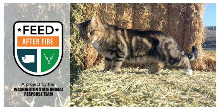
A cat in Omak patrols the hay at AgTech, the local feed store serving as the distribution center for the Omak/Okanogan Long Term Recovery Organization efforts.

The current version of Feed After Fire is looking to be wrapped up in time for the new year. Most of the funds have been spent in Okanogan County, as detailed in last month's update. This month we can add that we've delivered some much needed hay to people in Ferry County. Anything that is left over will be added to the Omak/Okanogan Long Term Recovery Organization efforts, including a kind donation from the Washington State Veterinary Medical Association to assist in the effort.