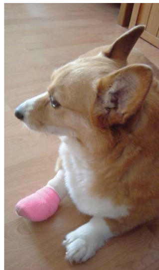
Photo of Foxxi by Aine, Creative Commons license, changes made: cropping