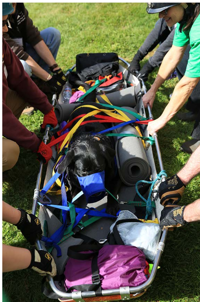
WASART members practice carrying a litter.

Shoreline Fire Department, Station 61 17525 Aurora Avenue North Seattle, WA 98133