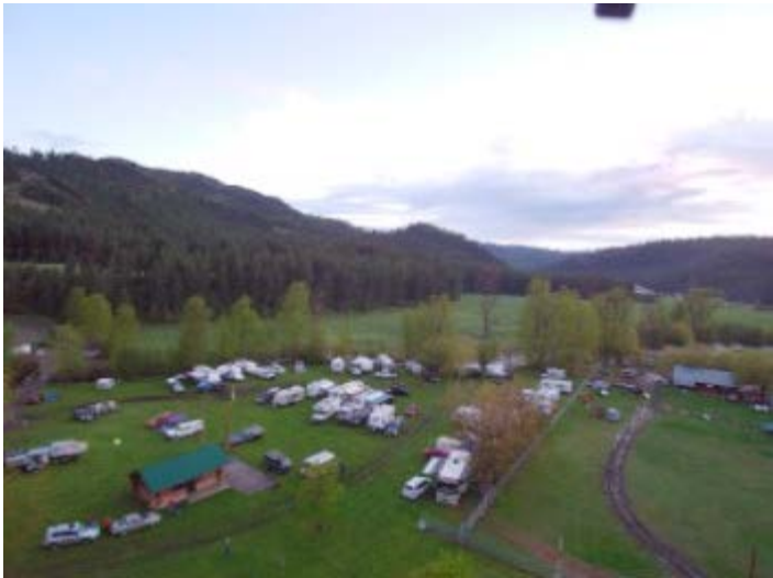
A drone photo from the night before the beginning of the conference shows off scenic Republic.