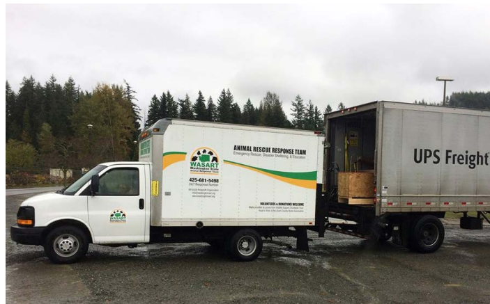
Transferring the new tripod/bipod to the box van.

This past year has seen the culmination of multiple years of planning, saving, and fundraising in regards to expanding WASART's capacity to save lives through equipment acquisition and positioning.