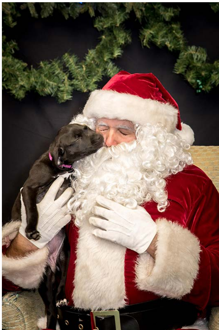
Santa gets a kiss from a young client.

What do pet lovers and pet stores with innovative and compassionate owners have in common? It's a desire to assist animal rescue organization meet their goals while also capturing a life-long memory of their beloved pets.