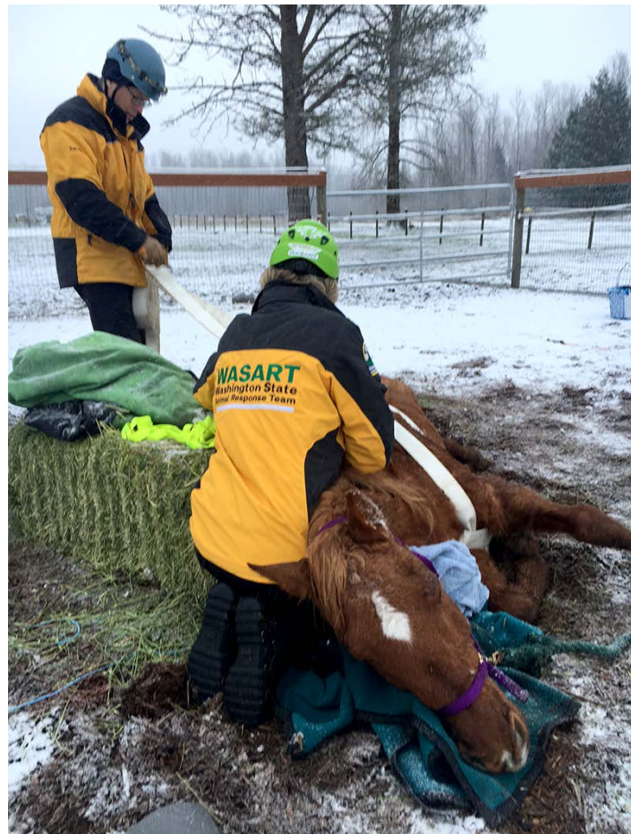
Tired, this horse rested its head on a responder's lap. [picture for illustrative purposes only]