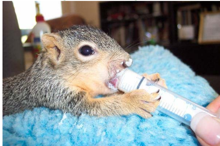
Baby squirrel being fed by wildlife rehabilitator

WASART is highly trained and very well equipped for technical and backcountry rescue, and emergency sheltering of domestic animals large and small. But there are some situations for which we are neither trained nor equipped. Foremost of these is dealing with wildlife, whether injured, trapped, or stranded. We get frequent calls for injured hawks, seagulls, deer, coyotes, raccoons, and other species, and sometimes for stranded marine mammals. Unfortunately, we aren't qualified to handle these situations. We do maintain an extensive list of emergency resources to address situations we can't deal with, and we refer these calls to the most appropriate resource.