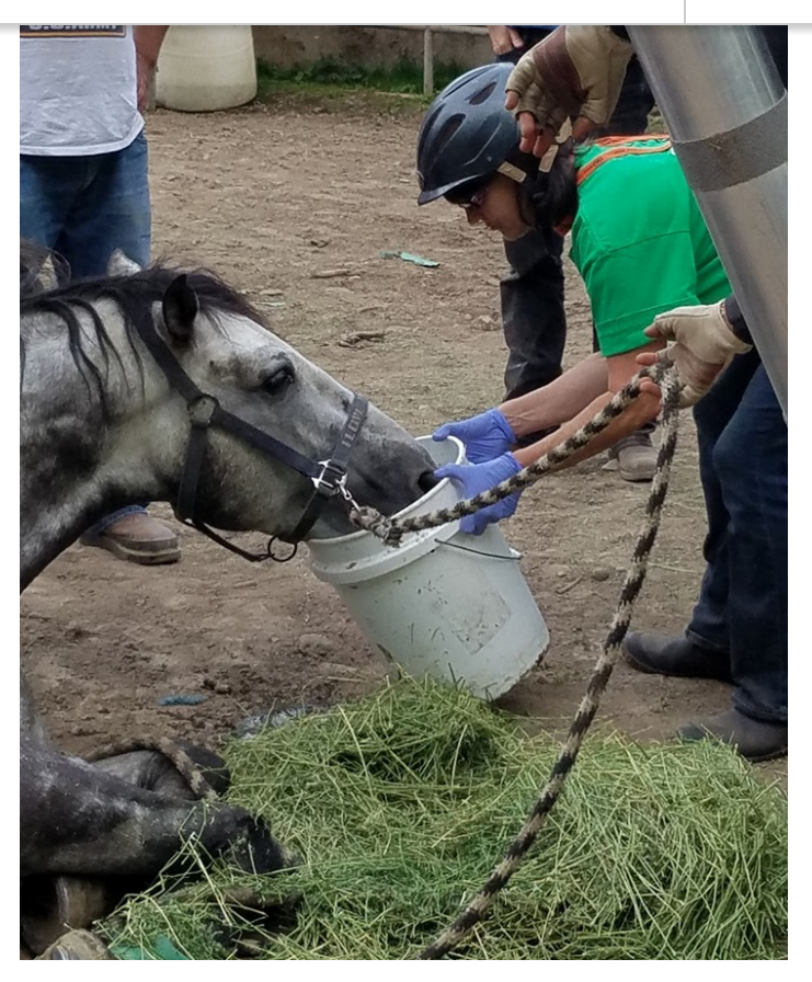
Helping Animals and Their Owners in Emergencies