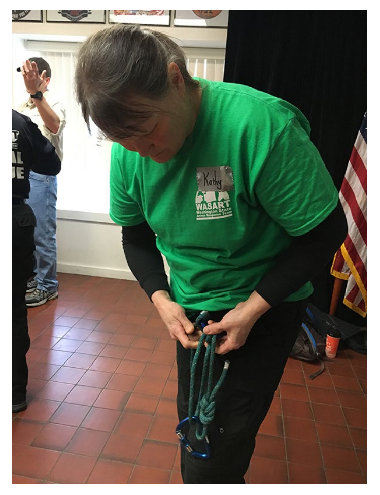
A student learns to tie a radium release hitch during a previous Ropes 1.

In response to increasing interest in the Technical Rescue Team, WASART will hold its annual two-day Ropes 1 class on April 13-14, 2019 in Lynnwood, WA. Although our monthly technical rescue practices are open to all members, the Technical Rescue Committee recognizes that the specialized technical knowledge required to run rigging systems can be daunting. Ropes 1 was designed to introduce members and non-members to the basics of rigging and safety in a fun, low-pressure setting. Students will learn the basics of technical rescue, including knots, mechanical advantage systems, general physics of technical rescue, and safety during a rescue operation. Students will get the chance to learn even more through the hands-on practice.