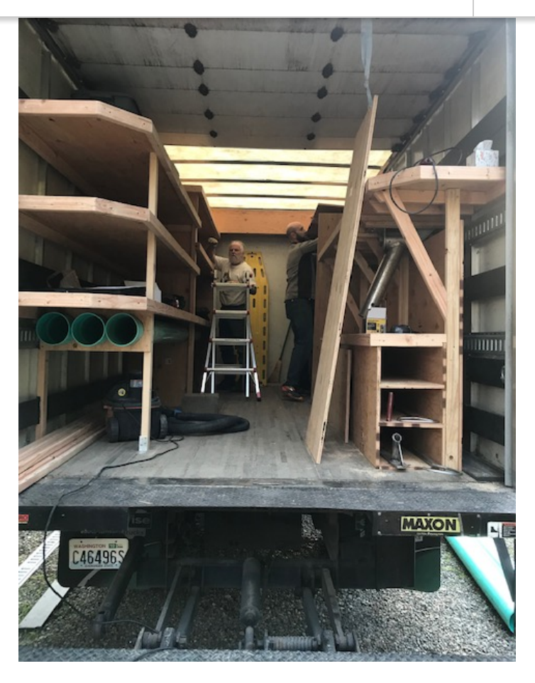
WASART members outfit the new van as a technical rescue vehicle.

Over the past few years, with the help of generous donors, WASART has added to its technical rescue equipment. The new equipment gives us the ability to help more animals, in more situations, even more safely.