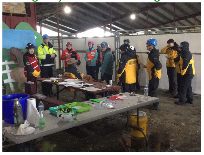
Volunteers meet to find out what roles they'll play during the Annual Exercise.

Every fall, WASART holds an Annual Exercise (AE) to put into practice what we've learned over the year. It is also an opportunity to learn about new equipment acquired during that time.