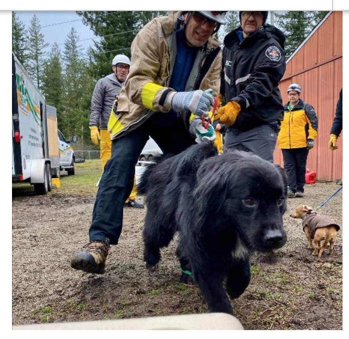
WASART teamed up with Steven's Animal Sanctuary to hold a training for members from the Snohomish County, WA, fire departments and swiftwater teams.

It's not every day that a team of professional firefighters decide they want to be more active in deploying nationally as a FEMA team to rescue animals during wide-area floods. But that exactly what personnel from Snohomish County Fire District #7 decided to do. Fourteen of them, many already on the Fire Department's Water Rescue team, trained with WASART instructors in Animal Rescue & Handling, at the Awareness Level.