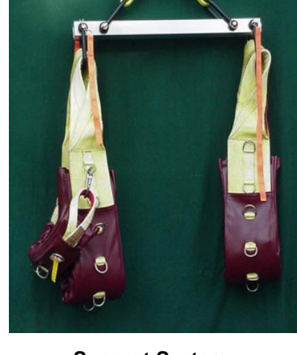
Support System Spread Bar w/ Shackles